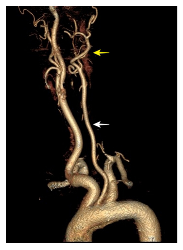
Figure 3. Angiotomography showing a patent left common carotid artery (LEFT CCA) (white arrow) leading to the left external carotid artery (LEFT ECA) (yellow arrow) and agenesis of the left internal carotid artery (LEFT ICA).