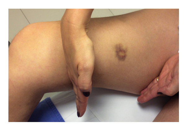
Figure 3. Control on day 7. Patient in group treated with tumescence, with minor bruising, indicating location of paresthesia.

In the majority of cases, varicose veins are the result of GSV incompetence, with or without incompetent perforating veins. Conventional treatment of the saphenous vein consists of ligature above the saphenofemoral junction and removal, which generally requires either general or spinal anesthesia. At many centers patients are still treated