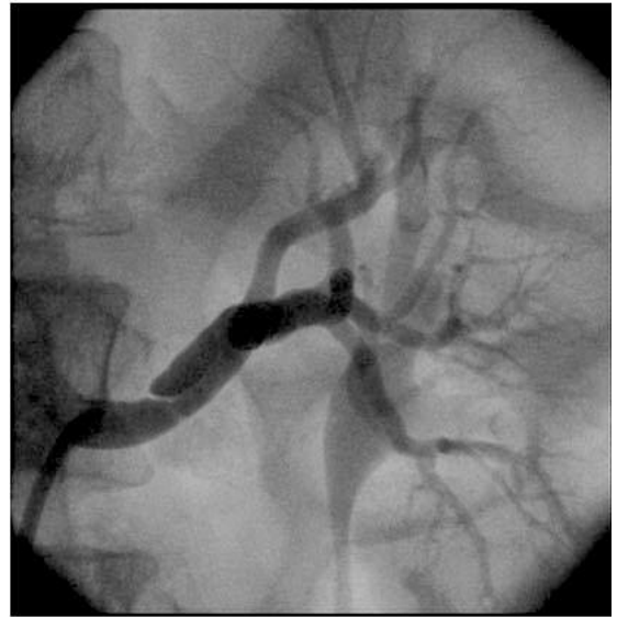
Figure 1. Arteriography showing stenosis in the mid distal third of the renal artery.

Spontaneous renal artery dissection may occur spontaneously or secondary to local changes involving the renal artery, such as atherosclerosis, intimal fibroplasia, Marfan Syndrome, and Ehlers-Danlos Syndrome, or even malignant hypertension or intense physical activity. 3,4 In this case, arterial disorders compatible with fibromuscular dysplasia of the renal arteries