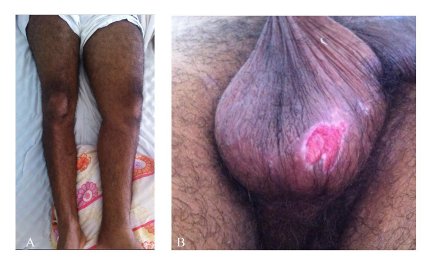
Figure 1. (A) Asymmetrical edema of the left lower limb secondary to iliofemoral deep venous thrombosis; (B) Genital ulcer.