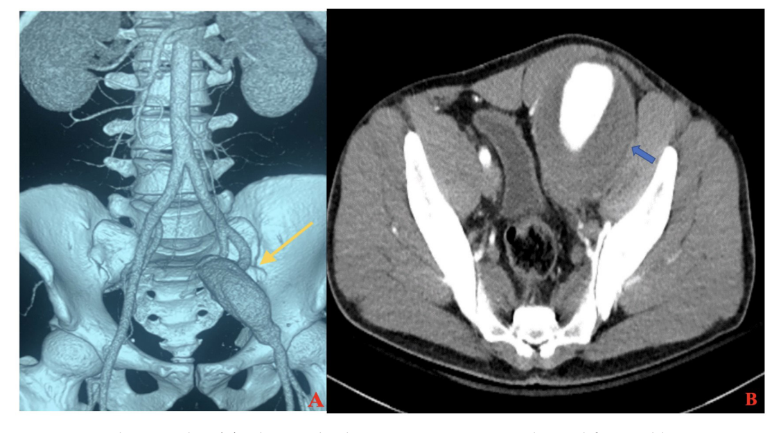
Figure 1. Computed tomography – (A) Volume rendered image- anteroposterior view showing left external iliac artery aneurysm (yellow arrow); (B) cross-sectional image showing aneurysmal dilation of left external iliac artery with intramural thrombus (blue arrow). The right external iliac artery and bilateral internal iliac arteries are normal.

After discussion with the patient, he was scheduled for open surgical repair because of his young age and preserved physiology. Intraoperatively, the retroperitoneal approach was used. The left femoral artery was exposed from a different incision in the