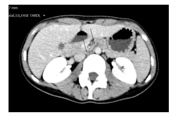
Figure 3. Axial plane of abdominal CT showing narrowing of the duodenum (black arrows) between the aorta and the superior mesenteric artery.

Conservative treatment for weight gain is sufficient in most cases, starting with enteric fluids if the patient is able to tolerate them. Treatment with nasojejunal