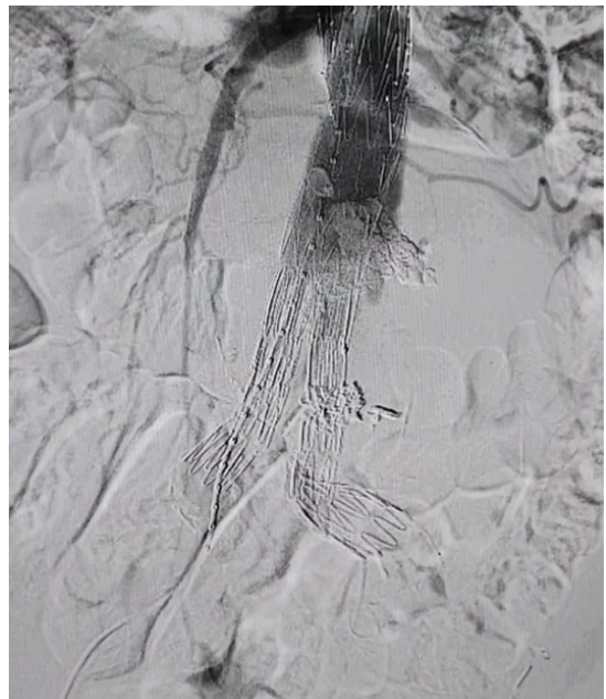
Figure 1. Initial angiography showing contrast extravasation at the proximal aortic neck (Type IA endoleak).

Given the proximity of the rupture site to the superior mesenteric artery (SMA) and renal arteries,