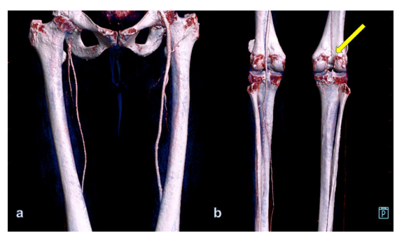
Figure 2. Angio CT with volume rendering 3D reconstruction showing infrafilling of a patent right superficial femoral artery (a). Total occlusion of the right popliteal artery (arrow) with absence of tibial vessels (posterior view). In the left lower extremity, all infrapopliteal vessels are patent (b), (patient #1).