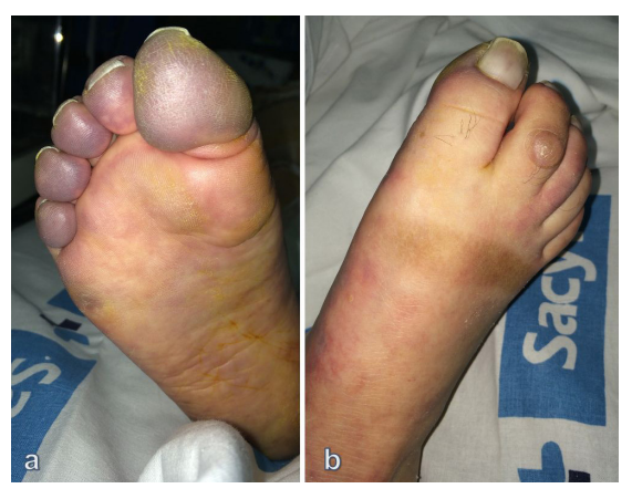
Figure 3. Picture showing patient's foot several hours after revascularization surgery. Digital cyanosis and fixed staining in foot indicate failed revascularization (a, b) (patient #1).

but unfortunately the patient died 12 hours later. Serologic testing detected IgG-IgM antibodies to SARS-CoV-2.