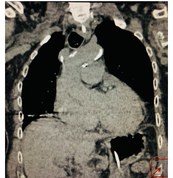
Figure 2. Incidental cardiovascular findings in computed tomography of the chest. Aortic wall calcification and cardiomegaly.