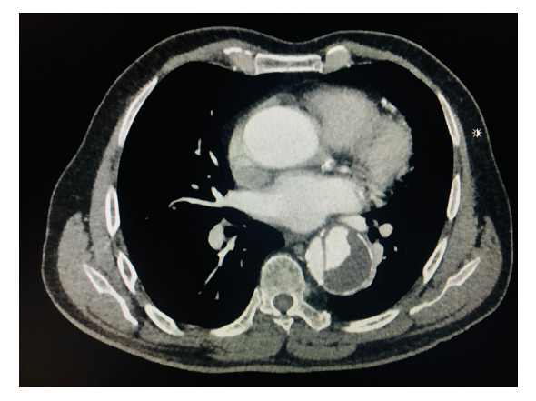
Figure 4. Incidental cardiovascular findings in computed tomography of the chest with contrast. Descending thoracic aorta dissection