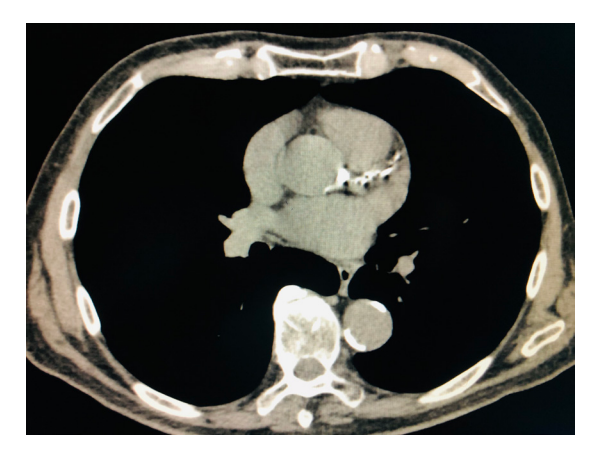
Figure 1. Incidental cardiovascular findings in computed tomography of the chest. Calcification of aortic and coronary wall.

The prevalence of pulmonary thromboembolism (PTE) detected with computed tomography angiographies of the chest was 24.4% (10 of 41 examinations with contrast). Twenty-eight of these scans were of patients already in hospital and 13 were of patients referred from the emergency department. The incidental