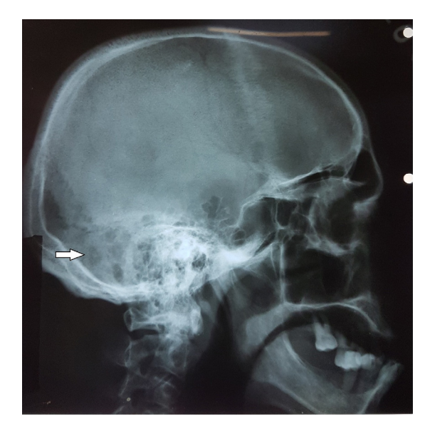
Figure 1. Lateral skull X-ray showing bony erosions (Arrow) suspicious for osteomyelitis.

showed an infrarenal AAA with an anterior-posterior diameter of 4.2cm. Adjacent to the aneurysm, there was a large retroperitoneal hematoma indicative of leaking. A non-contrast CT of the abdomen confirmed the USS findings. (Figure 2) Investigations available at the time revealed a WBC count of 13.26 \times 10^3 \mu L, Hb of 7.7g/dL, creatinine of 4.77mg/dL, C reactive protein level of 156mg/dL, and an ESR of 130mm in the first hour.