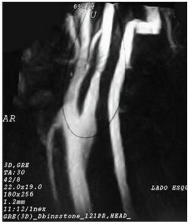
Figure 1 - Residual stenosis in a patient submitted to surgery 30 days ago

carotid artery, performing endarterectomy with complete removal of residual plaque (Figure 2). The patient had good postoperative course and is currently with 5 years of follow-up and no late complications.