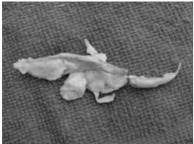
Figure 2 - Plaque removed from a patient submitted to previous incomplete endarterectomy

Recurrent stenosis can be caused by myointimal hyperplasia or by recurrent atheromatous plaque. Myointimal hyperplasia is characterized by exuberant fibrous proliferation. It is usually early, commonly between 6 months and 2 years after the procedure, characterized by smooth superficial