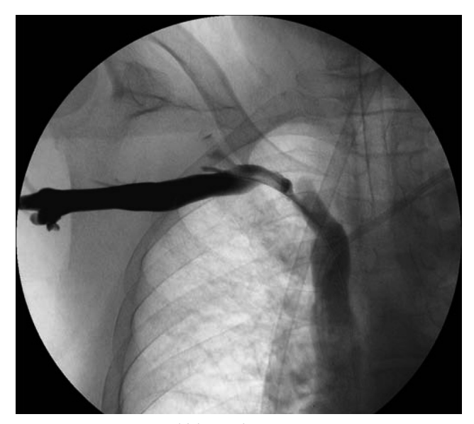
Figure 2. Intraoperative phlebography.

Color Doppler study surveillance performed four weeks after surgery showed AVF patency, signs of PTFE integration and a flow rate of 640 mL/minute. Hemodialysis via the AVF was satisfactorily initiated six weeks after surgery.