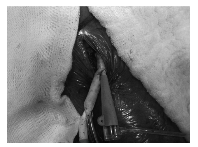
Figure 1. PTFE puncture with 10 F sheath.

Surgery was then performed, by right axillary vein and ipsilateral brachial artery dissection. A loop subcutaneous tunnel was created in the anterior arm and a terminal-lateral nonringed polytetrafluoroethylene (PTFE) 6.0 mm anastomosis was performed with the vein. The prosthesis was then punctured and a 10 F sheath was introduced (Figure 1). Intraoperative phlebography was obtained (Figure 2) and a hydrophilic 0.035" guide wire (Roadrunner<sup>®</sup> 260 cm; Cook) was passed beyond the subclavian lesion to reach the inferior vena cava. The diameter of the vein was estimated as 12 mm; after infusion of 5000 UI of intravenous heparin, subclavian vein angioplasty was performed using a 14×40 mm vascular balloon (XXL<sup>®</sup>; Boston Scientific) inflated to 10 atm for 3 minutes. Recoil was noted following a