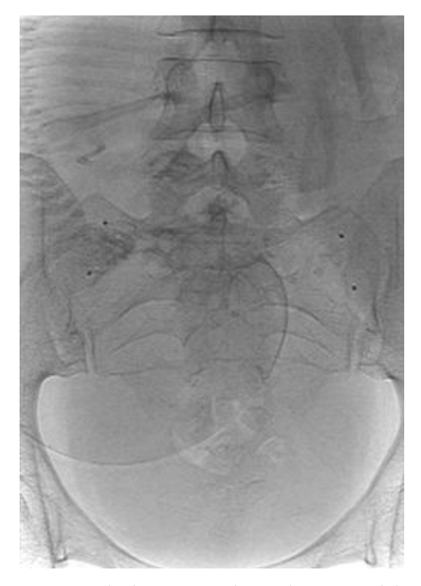
Figure 1. Final radioscopic control image demonstrating balloon position.

The diameter of the internal iliac artery is measured using a quantitative analysis feature built into the hemodynamic machine. Semi-complacent angioplasty balloons ( 7 \times 20 Passeo 35-Biotronik) are then positioned at the origins of the internal iliac arteries using angiography for guidance. Correct balloon positioning is checked on a control angiograph, taken after injection of 2 ml of contrast via the balloon, and then a final image is taken, as shown in Figure 1. The balloons are not inflated at this point and the catheters are taped to the skin to