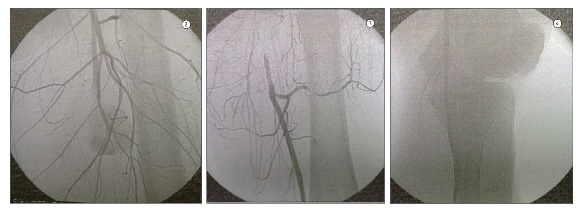
Figures 2, 3 and 4. Arteriography. Aneurysm of mid segment of the SFA with occlusion below and reinhabitation of the distal superficial femoral artery and the popliteal artery by collateral circulation.