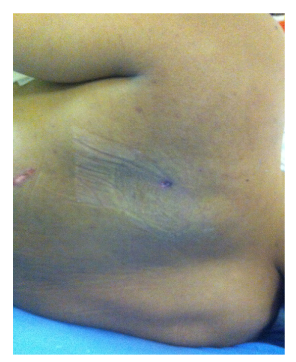
Figure 1. Gunshot entry wound in the posterior left chest.

Bullet embolism is a rare and challenging complication of gunshot injuries<sup>1-9</sup> with 0.3% incidence in 7,500 patients in a 10-year report<sup>2</sup> and fewer than 200 cases reported in the literature since 1900<sup>1,2,9</sup>. For a projectile to enter systemic circulation, it must have just enough energy to penetrate a blood vessel or the heart, but not enough to transfix the structure. Since this is unlikely, in most cases gunshot injuries tends to destroy vessels, rather than merely penetrate them<sup>5</sup>.