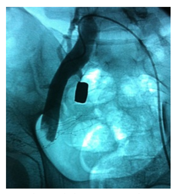
Figure 5. Iliocavography demonstrating patent right common and external iliac veins, with preserved lumens and no filling defects; a foreign body (bullet) is impacted in the proximal right internal iliac vein, without opacification of the middle or distal segments.

When an object enters the bloodstream through a cardiac chamber or an injured artery, the patient will probably be hemodynamically unstable and will need an immediate surgical intervention. On the other hand, patients with venous embolism are generally hemodynamically stable (with the exception of those with major venous damage such as vena cava injuries) and the entrance site very often