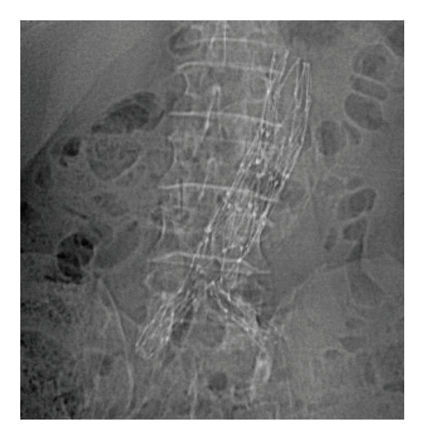
Figure 1. Standard abdominal X-ray showing tortuosity of an endoprosthesis branch.

Serial X-rays are useful in follow-up of endovascular AAA treatment for assessment of structural changes, especially when interest lies in detection of fractures and kinking of abdominal endoprostheses.<sup>15</sup> These X-rays are simple and inexpensive to obtain and are widely available. Additionally, their sensitivity for detection of graft migration is similar to that offered by computed tomography,<sup>15</sup> although an understanding of