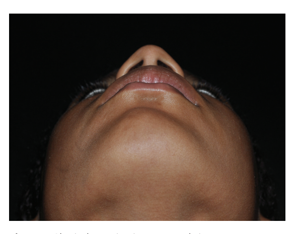
Figure 1. Physical examination, extraoral view.

Once the echographic examination had confirmed the vascular nature of the lesion with slow continuous flow and had identified its location, the decision was taken to employ sclerotherapy with 0.05 g/ mL of monoethanolamine oleate, administered on three occasions via slow infiltration of 2 mL into the