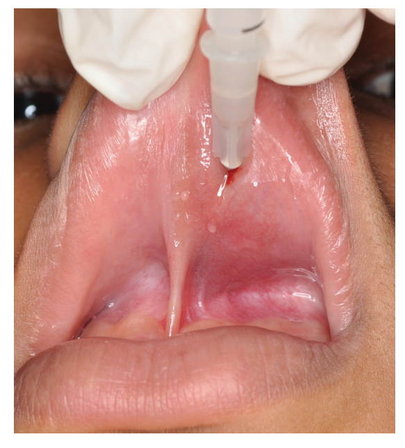
Figure 4. Administration of the sclerosing monoethanolamine oleate 0.05 g/mL.