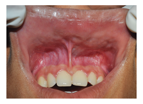
Figure 5. Four-month postoperative appearance.