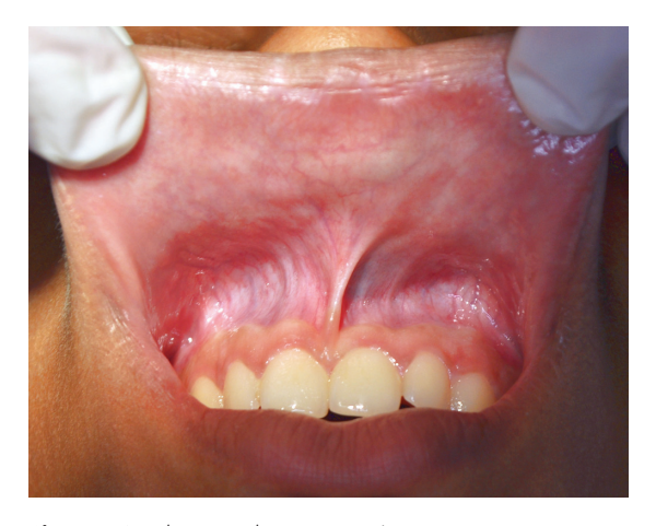
Figure 6. Twelve-month postoperative appearance.

Supplementary tests such as ultrasonography with Doppler may be needed to determine the nature of the blood supply to the lesion (arterial or venous), and can also aid with diagnosis. 5 The ultrasonography examination requested for the case described above confirmed the suspicion of hemangioma. The Doppler study revealed discreetly dilated vessels with low resistance flow and identified the lesion as venous in nature.