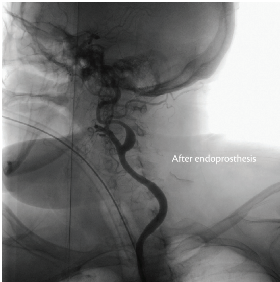
Figure 3. Control angiography showing final appearance after release of the endoprosthesis in the left common carotid artery.

occlusion of both carotid and the rupture site are performed. 4,6 Vascular ligation or occlusion involves a very high risk of ischemic cerebral events. 4,6,7 Surgical management should therefore prefer reconstructive techniques or those that preserve cerebral flow, whenever the patient's condition allows. 3 In our case, the patient had suffered a perforating carotid trauma that was sealed by the hemodialysis catheter itself, which had not been removed from the placement site (Figure 1). This meant that it was possible to conduct preoperative imaging exams and plan the most appropriate and safest technique for correction of the perforation. In order to avoid embolic complications caused by the large-caliber intra-arterial catheter, the patient was kept on heparin until the catheter had been removed and the endovascular repair accomplished.