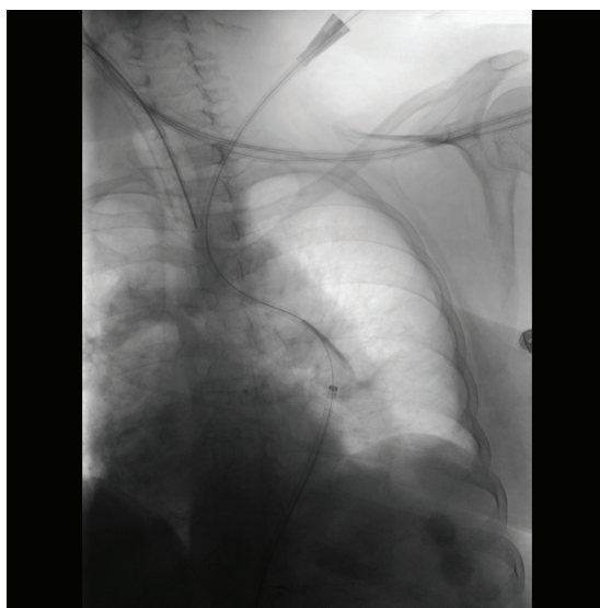
Figure 2. Fluoroscopy showing the hemodialysis catheter, the guide-wire and the 9 French long introducer sheath.

Later, the patient had a peritoneal dialysis catheter implanted without intercurrent conditions and was discharged in good clinical conditions.